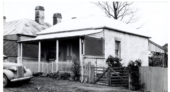
North Street Cottages

Named after Samuel North, the police magistrate at Windsor from 1829 to 1843. Many of the buildings in central Windsor were destroyed by fire in 1874, so these cottages provide an interesting example of the streetscape in the mid-nineteenth century. The roofing style on numbers 25 to 23, known as jerkinhead, provided shelter for people during times of flood.