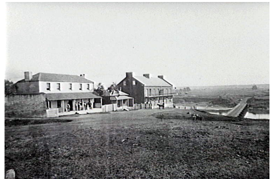
The Doctors House

From 1858 to 1992 this house was occupied by a series of doctors, the most famous being Thomas Fiaschi of Tizzana, a winery of distinction, near Ebenezer. Note the fanlights above the entrance doors, the columns to each side, the sandstone flagged verandah and the delicate iron railings, all giving the building a distinguished air. At the height of the 1867 flood, the water lapped the balcony on the first floor.