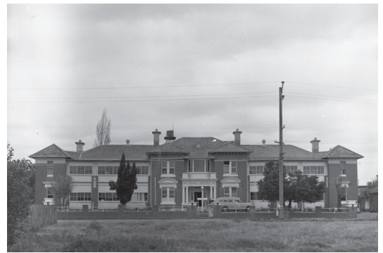
Former Hawkesbury Hospital and Convict Barracks

The original building was in need of upgrading to the standards of health care of the day and was refurbished, reopening in 1911. Designed in the Federation Arts and Crafts style by George Matcham Pitt, the building works completely altered the appearance of the building. The hospital, with many additions and alterations, continued to serve the Hawkesbury district until 1996.