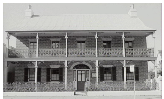
Loder House in George Street, Windsor 1979