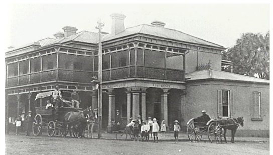
Old Windsor Post Office, George Street, Windsor