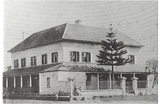
Macquarie Arms Hotel, George Street, Windsor

This two storey brick Georgian building with cellar and attic rooms was built in 1815 by emancipated convict Richard Fitzgerald and is the oldest hotel building in Australia (though it has not had continuous licence and is therefore constantly having to defend its title). It was occupied by the military during the 1830s, Although there have been extensive additions, much of the original interior woodwork is still intact, including the elegant staircases and colonial fanlights. A plaque on the garden wall facing the square indicates the height of the Great Flood of 1867, when the river reached 19.3 metres.