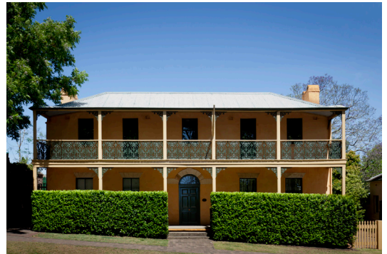
Howe House, Windsor