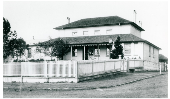
Windsor Court House, 1879.

One of Francis Greenway's best known buildings, the court house was completed in 1822 by William Cox using convict labour. During the early years of the settlement at Windsor, the building was used for everything from church services and meetings to elections. An 1820s portrait of Governor Macquarie, commissioned by local citizens, hangs in the public gallery (though doubts about its authenticity have been expressed in recent years).