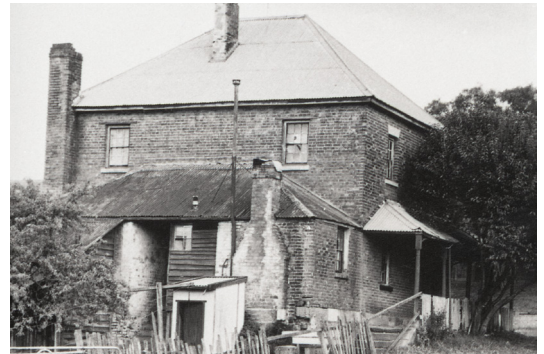
Former Peninsula Inn