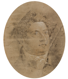
Francis Howard Greenway. Pencil portrait by unknown artist ML482.

Francis Greenway (1777–1837), an English-born architect, was convicted of the capital crime of forgery, his sentence being commuted to fourteen years transportation to Australia. He arrived in NSW on 7 February 1814 and was used by Governor Macquarie to rectify the poor standard of building in the colony. In 1816 he was appointed Civil Architect by Macquarie and as such became the first government architect of New South Wales. Some of the buildings still in existence include the Hyde Park Barracks and the Supreme Court in Sydney, Windsor Court House and St Matthews Anglican Church in Windsor.