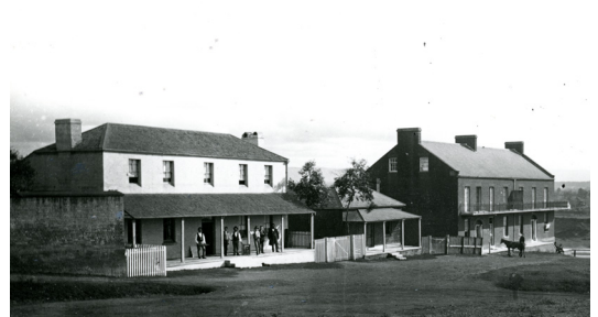
Thompson Square Windsor, 1879.

Named after Andrew Thompson and dating back to 1795, this is the only intact 18th century Georgian square in the country. Windsor (then known as Green Hills) was essential to the survival of the infant colony based in Sydney, which depended on the farms of the Hawkesbury and the river to carry their produce. The collection of colonial buildings around the square has remained largely unchanged since being built between 1815 and 1880. At the top of the square is the Pioneer Families memorial featuring an anchor, symbolizing the importance of the river in the history of the town.