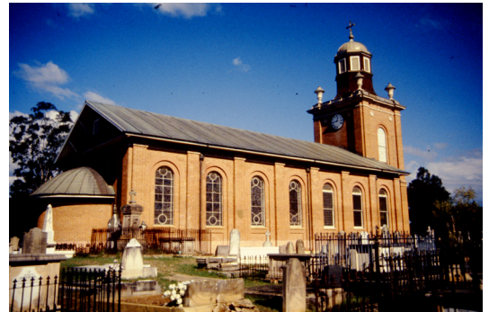
St Matthews Anglican Church, Cemetery and Rectory

The Rectory is the oldest rectory in Australia, Georgian in style, and built by William Cox to the plan of an unknown architect. The building is of exceptional design with elegant front entrance door and fanlight. Also note the two storey brick stable at the rear of the building.