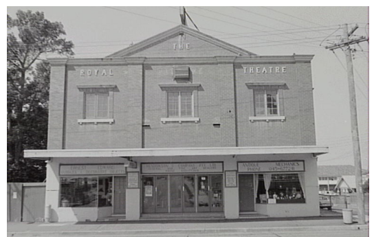
Royal Picture Theatre, Windsor 1979 by Margaret Chadwick

Opened in 1926 with the Cecil B. De Mille's production The Ten Commandments , the theatre was owned by Messrs Terry and Dixon. Contemporary advertising noted the marble stairways which led to the dress circle and the brown morocco leather chairs in the gallery. The floor was made of tallow wood which was ideal for dancing and the building was lit by electric light.