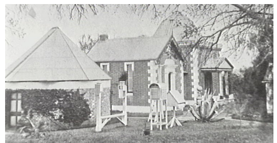
Tebbutt's Observatories, Windsor

John Tebbutt, astronomer and scientist, built his first observatory in 1863 (now demolished) and a second building (circular) in 1874 to accommodate a larger telescope. The square building was constructed in 1879. A large celestial globe owned by Tebbutt is now part of the collection of the Hawkesbury Regional Museum. Famous for discovering the "Great Comet of 1861" Tebbutt's astronomical and meteorological observations earned the respect of the scientific community and he was made a fellow of the Royal Astronomical Society London in 1873.