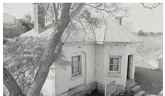
Toll House Windsor, adjacent to South Creek & the Fitzroy Bridge 1979 by Margaret Chadwick

The Toll House, now overshadowed by the modern bridge, was built in 1834 but was damaged during the 1864 flood. It was rebuilt on the existing foundations and was in use after 1887. The tolls collected were used to maintain the roads and bridges. The bay windows gave the tollkeeper a good view of the people using the roads.