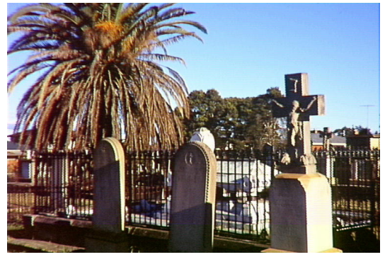
Windsor Catholic Cemetery, Windsor 1994