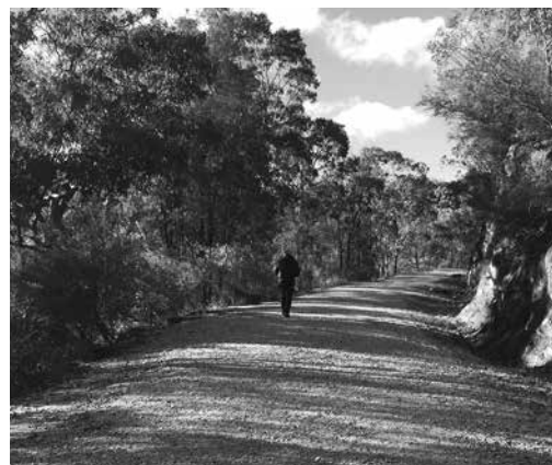
The Great North Road, by M.Duncan 2018

A fifteen minute walk up a gentle gradient leads to spectacular stone walling, culverts, quarries, buttresses, chiselled and blasted rock faces and hand hewn drains.