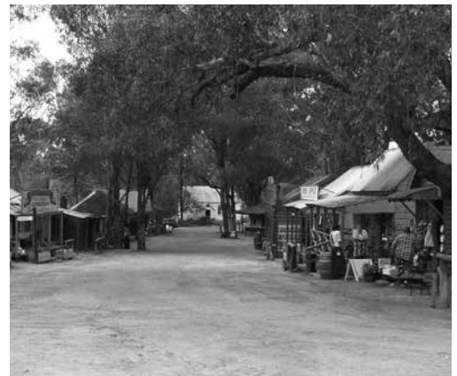
Australiana Pioneer Village by W.Irving 2016

Some of the re-sited buildings include the Black Horse Inn stables from Richmond, Bowd's Sulky Shed from Wilberforce, Marsden Park Public School and the Kurrajong Railway Goods Shed. The village was purchased by Hawkesbury City Council in 1984 and the buildings were listed on the NSW Heritage Register in 2004. In 2010 The Friends of the Australiana Pioneer Village leased the site and it officially reopened to the public in 2011. Run by volunteers, it opens every Sunday and on public holidays (Except Anzac Day).