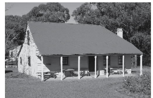
Rose Cottage, Wilberforce