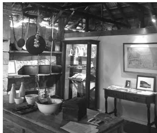
Cobham Hall