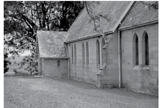
St James Anglican Church 1962 R. D. Power (HLS)

Designed by Edmund Blacket and built by Thomas Collison in 1857-58, this church was constructed from sandstone quarried at Longneck Lagoon. Blacket also designed the 24 pews, pulpit, reading desk and communion rail. Behind the church, looking toward the flood plain, is a stone marker indicating the level of the "terrible flood" where it reached its greatest height on Sunday 23 June 1867.