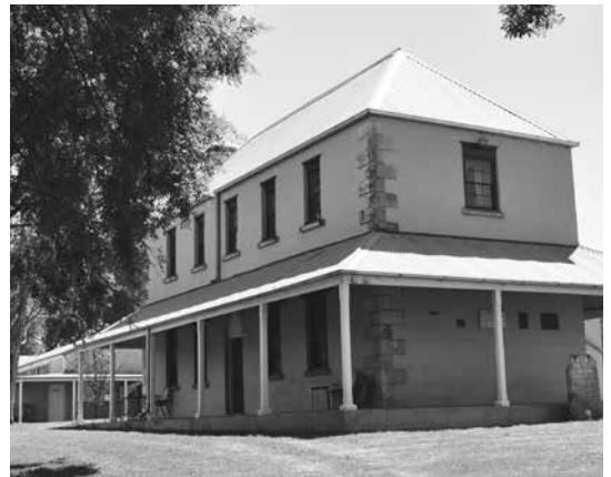
The Macquarie School House, Wilberforce by G.Ewin 2010

The school house was constructed, to Macquarie's design, of sun-dried brick coated with a mixture of lime and fat to keep moisture out. The building was rendered in 1911 to preserve it.