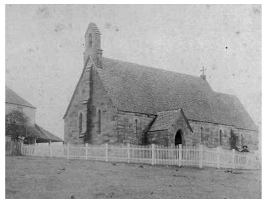
St Johns Church, Wilberforce