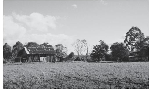
Pitt Town Bottoms

For many thousands of years this land was cared for by the Darug aboriginal people and was known by them, as Bardo Narrang, meaning Little Water. The first Hawkesbury land grants were on the banks of South Creek and here on the banks of the Hawkesbury River. At that time it was named Mulgrave Place by Lieutenant-Governor Grose. By April 1794, most of the initial 22 settlers were farming along these fertile flats on 30 acre grants.