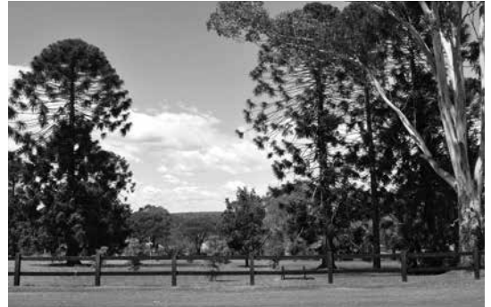
Wilberforce Park

Marked as the Town Square in 1811, this public space bounded by Macquarie, Church, George and Duke Roads is now known as Wilberforce Park. Like the parks in Windsor and Richmond, Wilberforce Park is a rare remaining example of Macquarie's foresight and town planning.