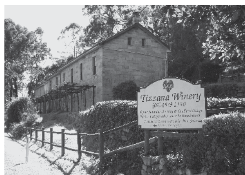
Tizzana Winery

The original winery consisted of a two-storied sandstone structure for living quarters and cellars, attached to a three-storied building to process the grapes.