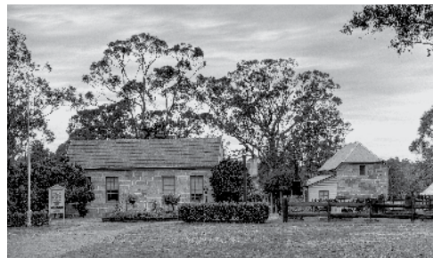
Ebenezer Church